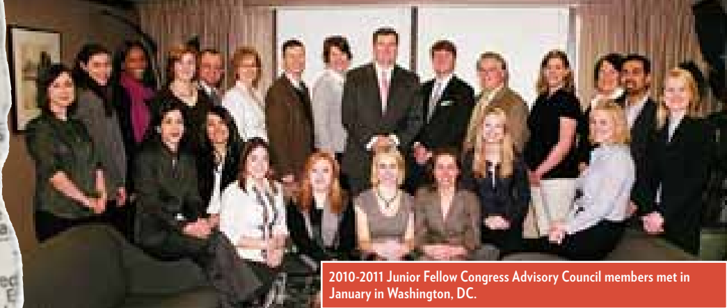
2010-2011 Junior Fellow Congress Advisory Council members met in January in Washington, DC.