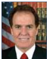
Rep. Phil Gingrey, MD, FACOG