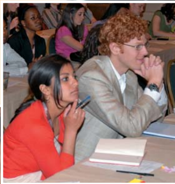
Medical students learn about residency options and ob-gyn career possibilities at the annual ACM medical student course.