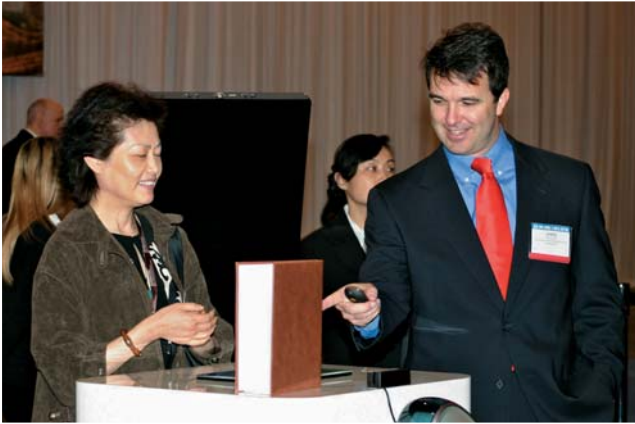
An exhibitor highlights his company's technology in the ACM Exhibit Hall.