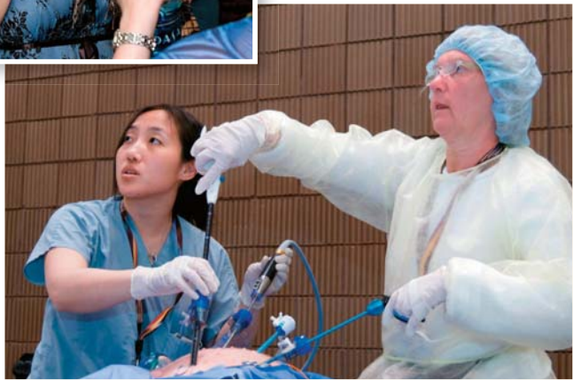
A participant in a hands-on course learns new skills.