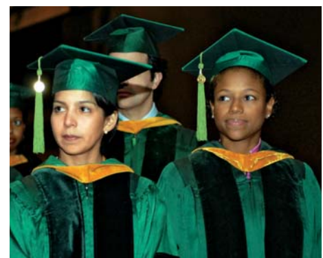
Some of ACOG’s newest Fellows at the ACM Presidential Inauguration and Convocation

“I ask that you take a fresh look at patient safety in your office. I believe that by adopting and fostering a variety of the best practices, including team training, we will improve patient safety. I ask that you also consider adopting and expanding a proven alternative like the 3Rs program. By implementing [my new] initiatives, as ob-gyns we can regain control. . . . Let’s renew our commitment to improving the health care of all women in this country and throughout the Americas. Let’s renew our commitment to improving the knowledge and