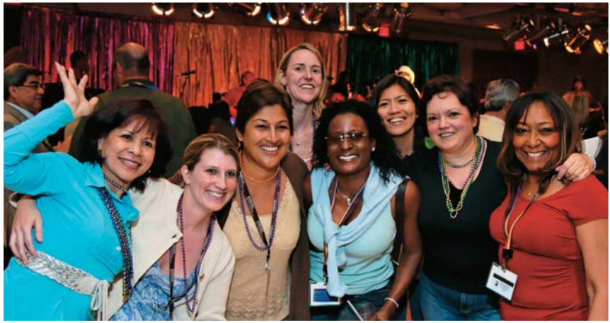
Friends gather at the ACM Welcome Reception.