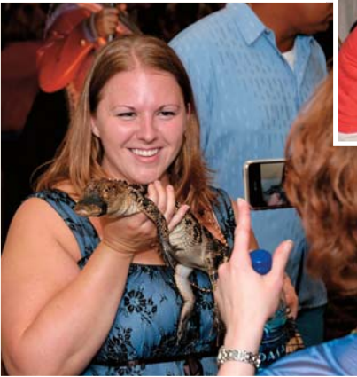
An ACM attendee meets with the local wildlife.