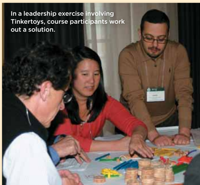
In a leadership exercise involving Tinkertoys, course participants work out a solution.

Participants in the sold-out ACOG course "Quality and Safety for Leaders in Women's Health Care" learned key patient safety and quality improvement principles and techniques. The course was held March 26–28 in Washington, DC.