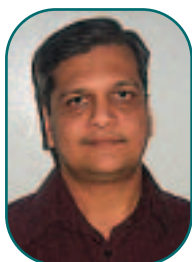
▲ Dr. Goud

The study found no significance in cervical dysplasia and squamous cell carcinoma of the cervix. It did, however, discover that COX-2 may play a role in adenocarcinoma of the cervix.