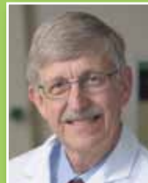
Francis S. Collins, MD, PhD