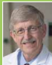
Francis S. Collins, MD, PhD